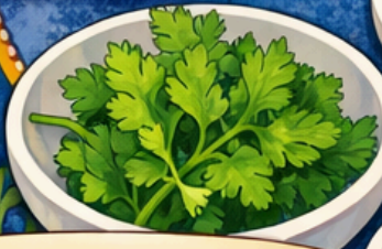
Karpas (Green Vegetable)